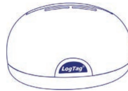
LTI HID Not Included